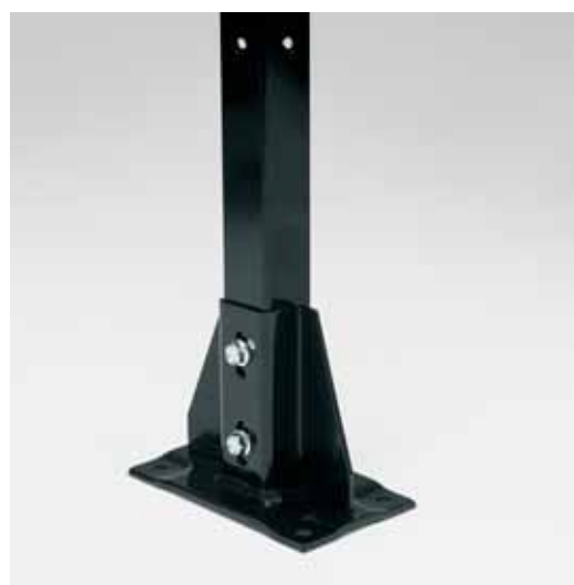
Fixing foot with adjustment of +/- 10 mm